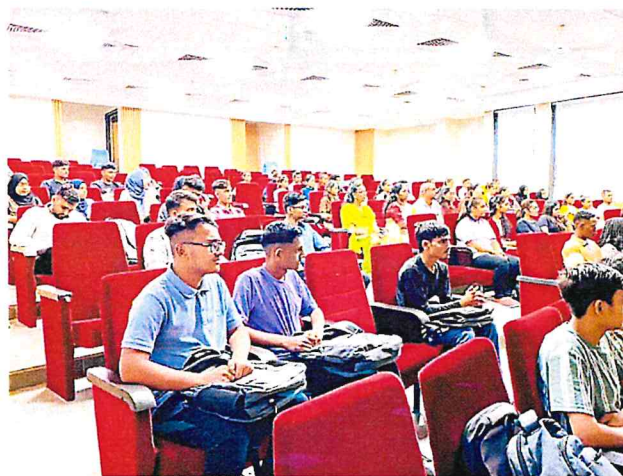
Ragging Awareness Week from 09-01-2019 to 13-01-2019